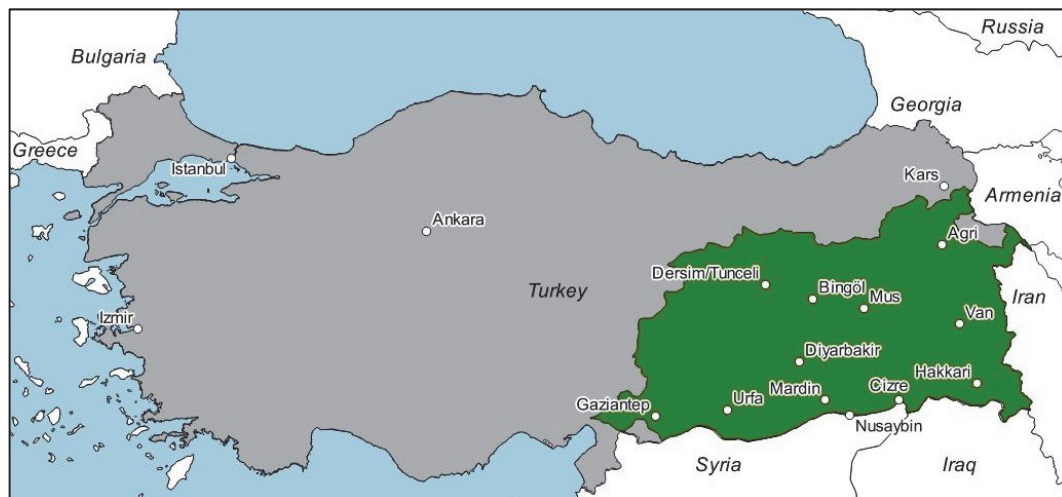
Figure 1: Map 6

The Kurdish nation straddles four contemporary states: Turkey, Syria, Iran and Iraq. The Kurdish population in Turkey is the largest of the four, numbering between 12 and 15 million or 18–23% of Turkey's population (Gunter 2010). The area of Kurdistan within the Turkish state's boundaries is known as Northern Kurdistan or Bakurê by many Kurds, rejecting Turkey centric terms like the 'South East' or the East (Jongerden 2007: 30; Gündoğan 2011).