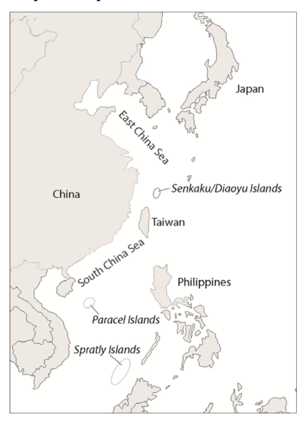
Figure 2: Map of the disputed areas in the East and South China Seas