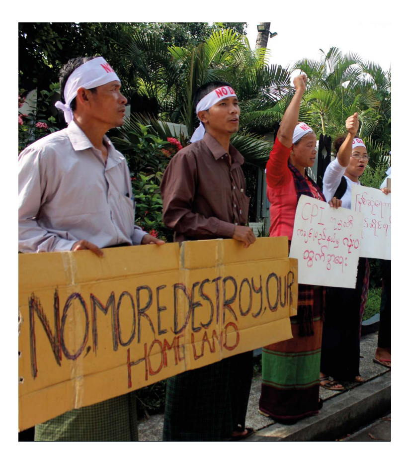
China's Myitsone hydroelectric dam project in northern Myanmar was suspended in 2011 after locals and environmentalists demonstrated against its environmental impact, displacement of residents and location on the Sagaing fault line.

How the coup will affect the peace process, and these linkages, remains to be seen. One possibility is that the military seeks to build legitimacy by taking charge of it, actually making concessions on federalism, and taking on board local sentiment against Chinese