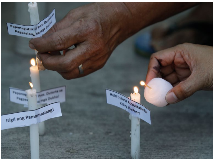
A scene from the past? Activists lit candles to protest the killing of farmers in a central Philippine province in Manila, Philippines, Monday, 1 April 2019. Police said that they were suspected communist rebels who opened fire during raids. But rights groups countered that the men were farmers and victims of extrajudicial killings. (Photo: © picture alliance/AP Photo | Aaron Favila).

I argue that the inability to successfully bring suspects to justice and the resulting damage to the police's self-image as a potent guardian of peace and order foster vigilante activities by police where a political and social environment exists that legitimizes such a strategy of violent crime control.