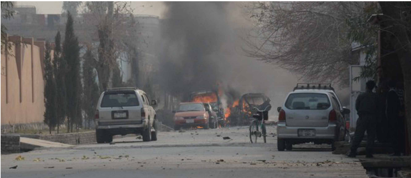
A suicide bombing against an office of the charity 'Save the Children' in Jalalabad, Afghanistan January 24, 2018 (Photo: © dpa/AA).