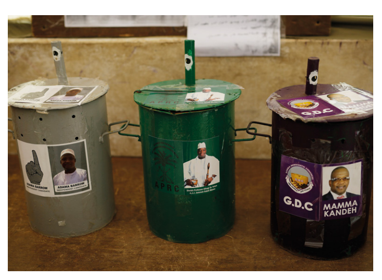
Three ballot drums in a polling station in Serrekunda, Gambia, Nov. 30, 2016, on the eve of the presidential elections.

The African Union's (AU) peacebuilding efforts in The Gambia reflect the organization's growing responsibility in this field. From 2018 to 2020, the AU deployed the African Union Technical Support Team to The Gambia (AUTSTG). Drawing on interviews and document and media analyses in 2020/2021, this PRIF Spotlight examines this novel mode of engagement and points out an emerging dilemma: The AUTSTG was successful as a technical and pragmatic intervention. However, this only came at the expense of supporting long-term political processes and thus undermined the AU's holistic peacebuilding policy.