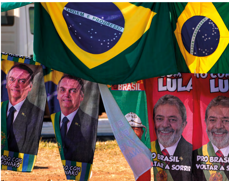
Presidential election campaign flags hang for sale, featuring the faces of both current President Jair Bolsonaro, left, and former President Luiz Inácio Lula da Silva, outside the Supreme Electoral Court in Brasilia, Brazil.

Brazil's presidential elections are scheduled to take place on October 2, 2022. The confrontation between the extreme-right incumbent president Bolsonaro and the center-left former president Lula Da Silva provides a rare setting. The election places Brazil at a crossroads and will set the stage for either a comprehensive commitment to democracy under Lula or a continuation along the path to authoritarianism under Bolsonaro. Recent polls suggest that the most likely scenario is a win for Lula. Nevertheless, Brazil's democratic institutions are continuously under attack. Currently, the possibility of the elections being preemptively cancelled or the final results being contested cannot be fully dismissed.