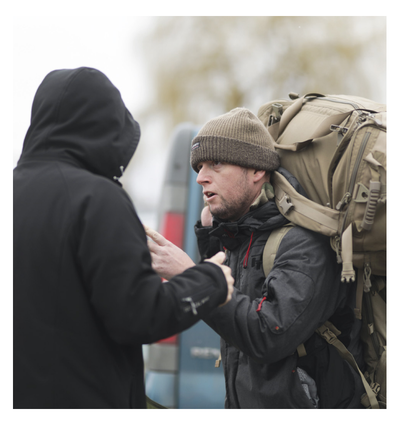
Foreign Fighters cross the border to fight for Ukraine as Russia's attacks on Ukraine continue, in Przemysl, Poland on 05 March 2022.

First, both groups are an expression of an increasing privatization of war and security. In the case of the mercenaries, this is obvious. But foreign legionnaires, too, undermine the state monopoly on the legitimate use of force. They make individual decisions to intervene in an armed conflict without this being part of their respective state's strategy, let alone democratically legitimized. In Germany, for instance, fighting in foreign conflicts is not punishable—unless significant actions are planned abroad that could harm the foreign relations of Germany. On this basis, citizens who are classified as right-wing extremists, for example, are denied permission to leave the country.