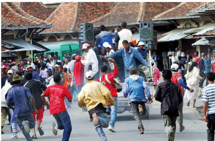
In February 2009, ten thousand protestors gathered in Antananarivo, Madagascar, to call for the removal of President Marc Ravalomanana.

In 2007, African Heads of State and Government adopted the African Charter on Democracy, Elections and Governance. This regional instrument was supposed to “promote the universal values and principles of democracy.” Yet has it had such an effect? With this PRIF Spotlight I shed light on two country cases – Madagascar and Burkina Faso – in which the Charter was (not) used by civil society organizations in their struggle for better democratic governance. If the Charter is to become an effective instrument in the hands of civil society in the future, the African Union will have to invest more in its popularization and active promotion.